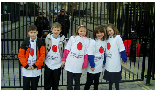
The Fantastic Five!

The campaign has certainly developed some momentum. It has been covered on television; twice on Newsround and The One Show and has also received a mention in Prime Ministers Question Time.